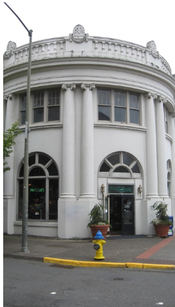
Coos Bay National Bank Building, often referred to as "Bugge Bank". 1923 National Register